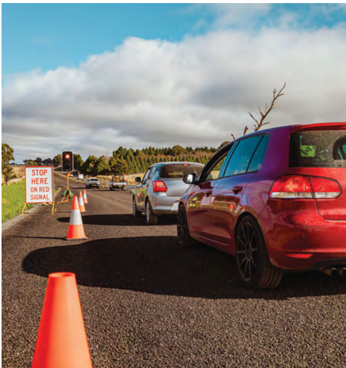
End of queue example with traffic stopped at temporary traffic lights

Motorists are encouraged to plan ahead, check Live Traffic at livetraffic.com or download the Live Traffic NSW App , and allow extra travel time when you are travelling between Narrabri and Moree.