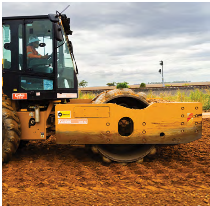
Padfoot Roller compacting soil in Section 2