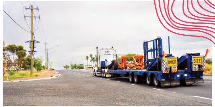
An Oversize Overmass vehicle travelling on the Newell Highway at Bellata