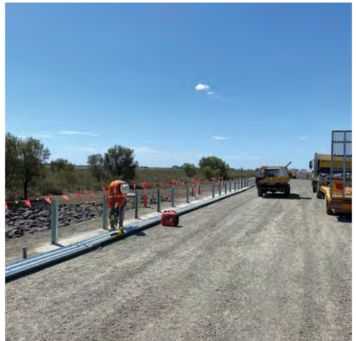
Installing new guard rail in Section 5 north of Clarks Gully

We acknowledge the impact the construction has had particularly on the Bellata community and we thank them for their patience during this time.