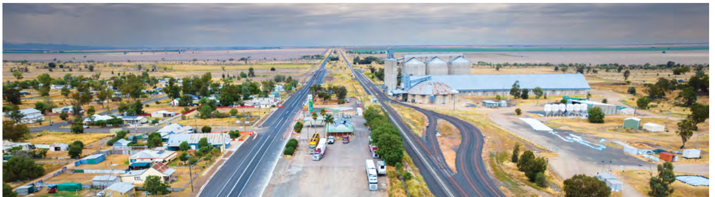
Looking south towards Bellata in Section 3

The Australian and NSW Governments are jointly funding the $261.17 million Newell Highway heavy duty pavement upgrades between Narrabri and Moree.